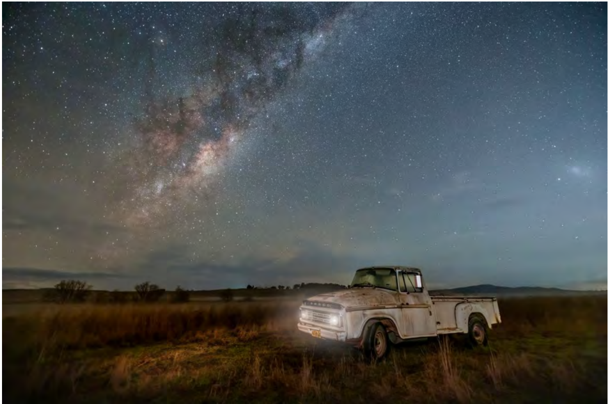
Old Ute Lights up the Milky Way

Meeting ID: 967 546 8014 Passcode: mXG4B7ext