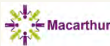
image Resizing in Adobe Express

If you don't use Lightroom or Photoshop to resize your images for competition you can still use Adobe Express (for free!) to correctly size your images. Click below for instructions. We will go through the method during the Post Production Workshop but if you need your own run through just contact the Secretary.